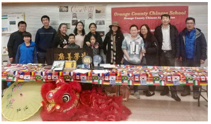
Multicultural Night : OCCA youth and families performed outreach at Cornwall Central Middle School on February 26, 2019.