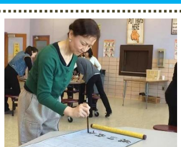
The art of writing: Children and adults alike try their hand at calligraphy.